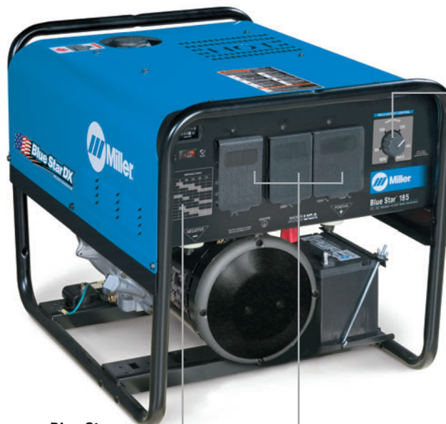
Blue Star 185 DX shown

Quick-reference parameter chart provides convenient amperage setting guidance.